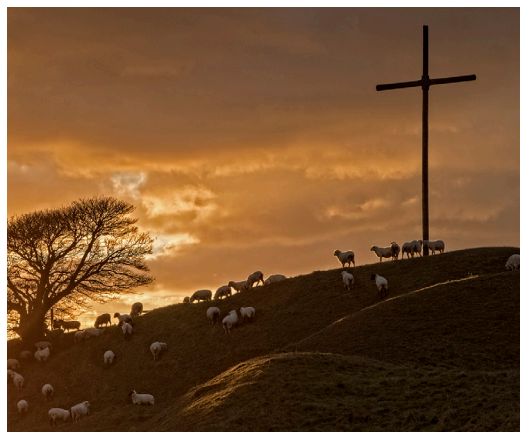
ABOVE RIGHT: RAWLSBURY CAMP - SEE THE ROUTE EXTENSION!

6. 50m down the road is a stile on your right. Climb it and head across the field to the stile the otherside. Do the same in the next field crossing the stile carefully on to the road. Turn right & in 75m you'll find yourself at The Fox!