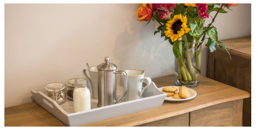
All room rates come with a cooked to order breakfast. We can offer special rates for group bookings or if breakfast in not required. Please give us a call to discuss your options if one of our example packages doesn't work for you.